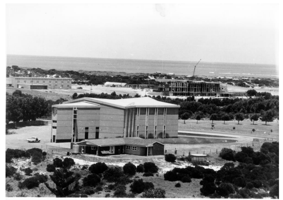
Holy Cross Cathedral at Geraldton was completed in 1964 (Geraldton Library 756)

During the period 1961-1964, Ed Whitaker was frequently travelling to Geraldton, designing and overseeing the building of the striking Anglican Geraldton Cathedral of the Holy Cross. Ed envisaged the cathedral as an interesting 'horizontal' building 'that could be looked down on from the various vantage look-out points' as well as being 'of bold, dynamic character from the near view'. He believed that 'fine and delicate tracery had no place in the North. The concept for the design of the Cathedral of the Holy Cross resulted from a functional analysis of what went on in the place, with the result that it was based on the Greek amphitheatre, which featured the main performer in the centre and the audience on all sides. For the same reason, the baptismal font is in the centre with a space for congregating around it.'